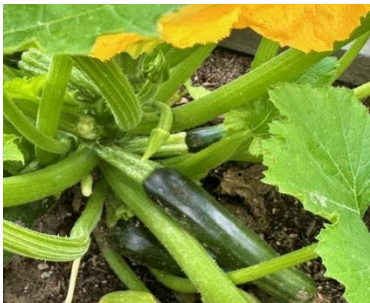
Multiple zucchini & summer squash are here —please take just one per visit 🥒🍆