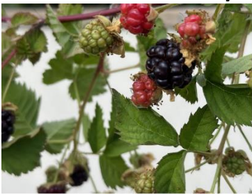
Juicy berries are ripe and ready —sweet and delicious 🍓