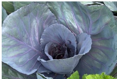
So much life, color, and flavor in our beautiful Ovation Garden—come enjoy the bounty!