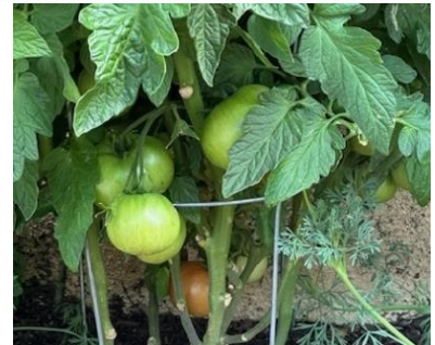
Tomato plants are thriving along the back wall 🍅