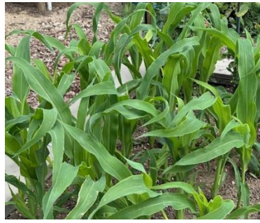
Corn is just starting to shoot up —watch it grow tall 🌽